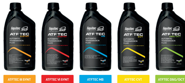
ATFTEC III SYNT ATFTEC VI SYNT ATFTEC MB ATFTEC CVT ATFTEC DSG/DCT